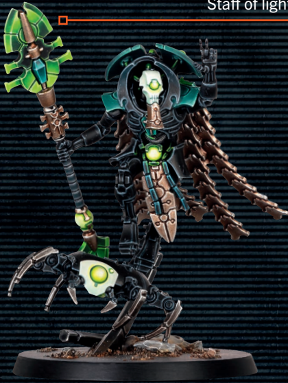
Staff of light