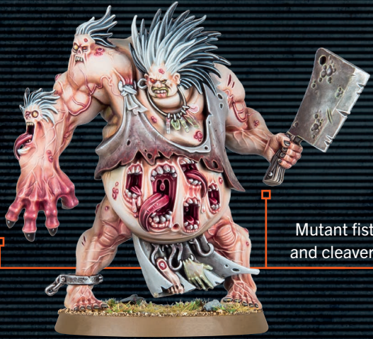
Mutant fist and cleaver