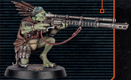
Kroot hunting rifle