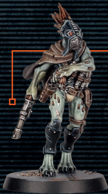
Dual Kroot pistols