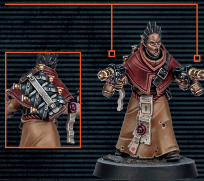
Twin hand flamers