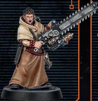
Eviscerator & hand flamer