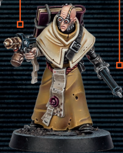
Chainsword Hand flamer