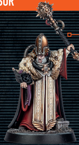
Mace of Censure